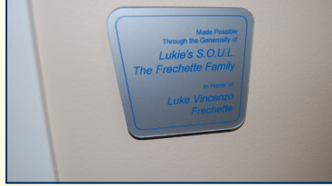
Pediatric emergency department bereavement room